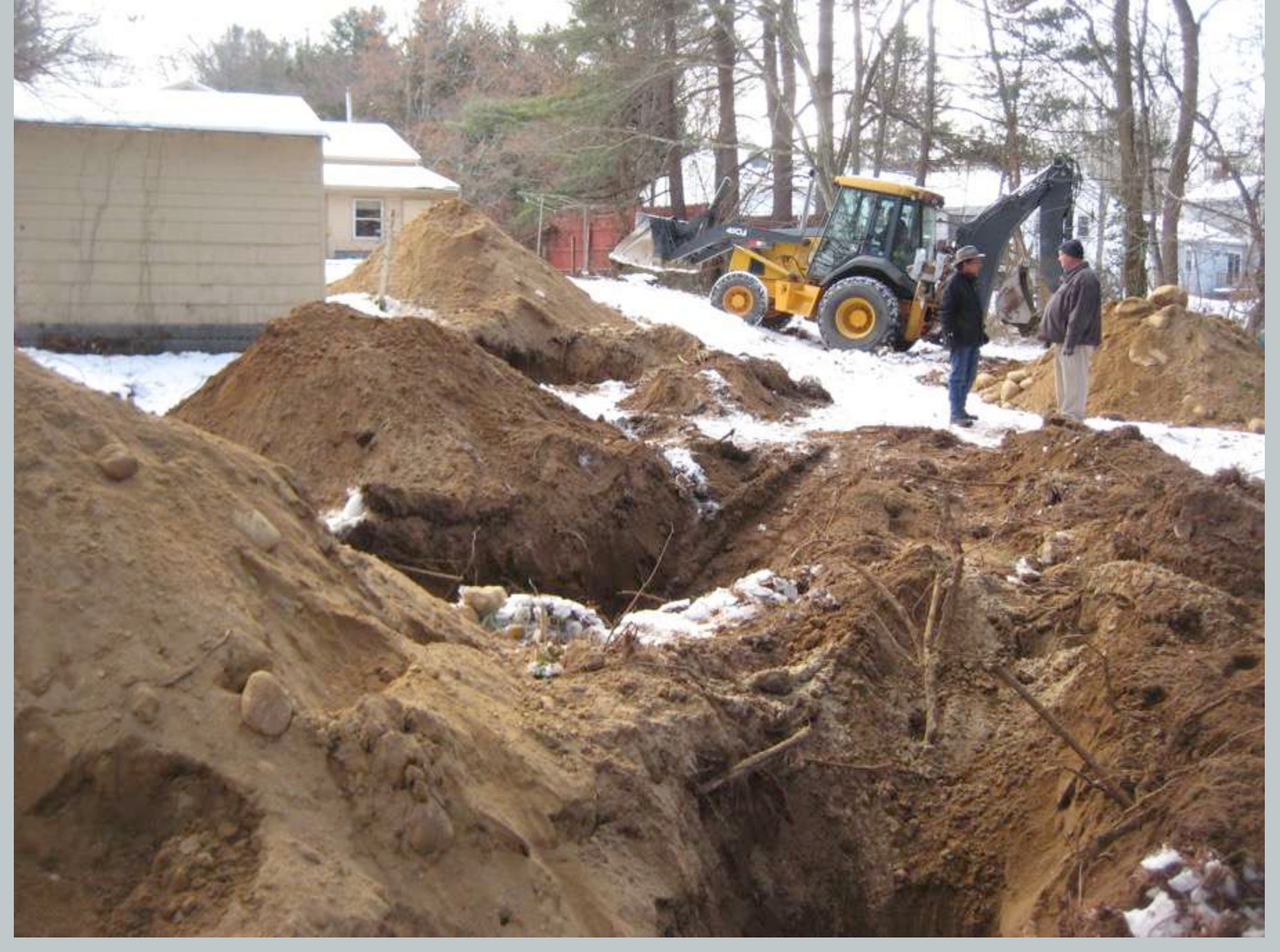
Arrowhead Road, Concord