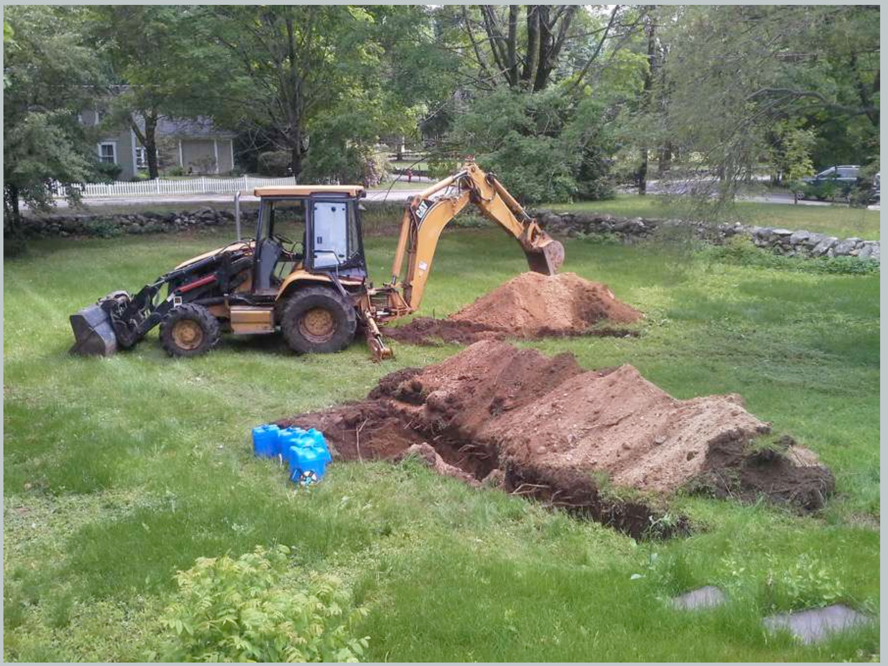
Mainstone Farm, Wayland